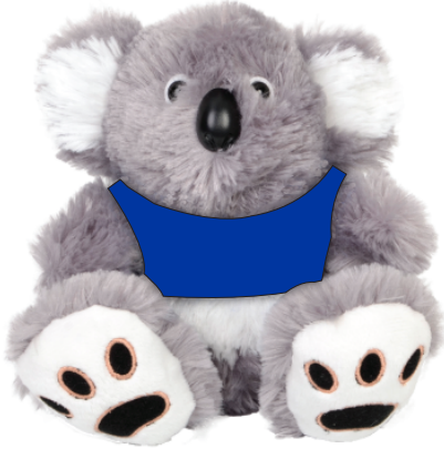
Sample of finished product. Approx. 30% size