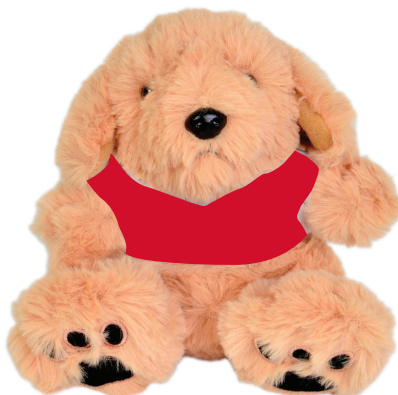
Sample of finished product. Approx. 30% size