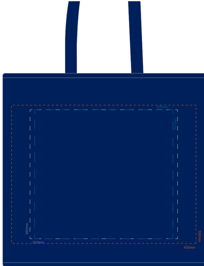
Front / Back